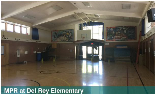
MPR at Del Rey Elementary