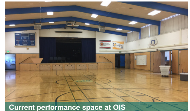
Current performance space at OIS