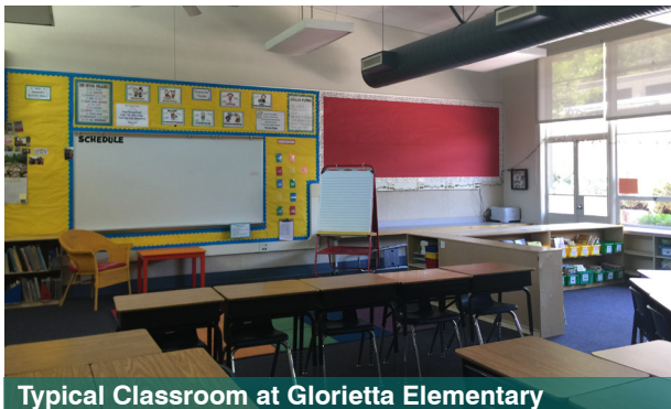
Typical Classroom at Glorietta Elementary