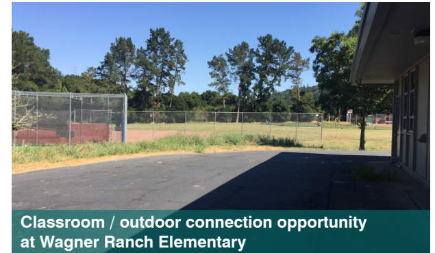
Classroom / outdoor connection opportunity at Wagner Ranch Elementary